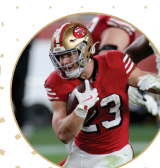
RB CHRISTIAN MCCAFFREY (7)