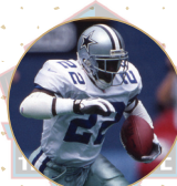
RB EMMITT SMITH (8)