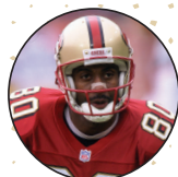
JERRY RICE 1998 TERRELL OWENS (1,097) (1,157)