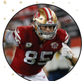
GEORGE KITTLE 2021 DEEBO SAMUEL (1,310) (900*)