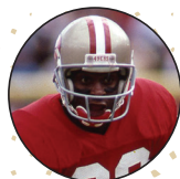
JERRY RICE 1989 JOHN TAYLOR (1,077) (1,483)