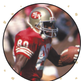
JERRY RICE 1991 JOHN TAYLOR (1,157) (1,206)