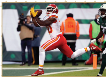
WR TYREEK HILL AT NYJ (12/3/17)