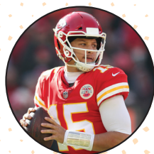
PATRICK MAHOMES (915)