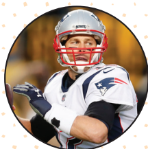
TOM BRADY (948)